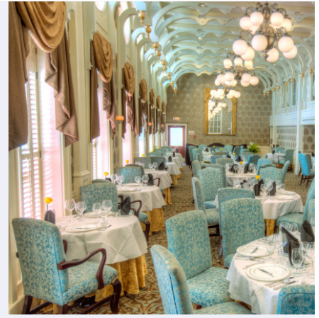
Dine in the Lovely J. M. White Dining Room

This premier experience features included shore excursions in every port of call, complimentary wine and beer with shipboard dinners featuring regional cuisine utilizing fresh ingredients creatively combined with a contemporary flair, daily Riverlorian lectures onboard, exciting entertainment every evening — including featured guest performances by sensational local artists.