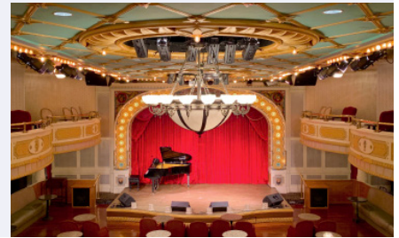
Take in World-Class Entertainment in the Grand Saloon